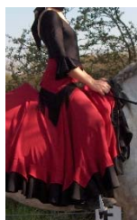
10 points FOLK DRESS