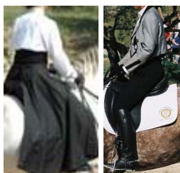
12 points PART DRESS