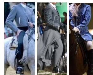
16 points FULL DRESS