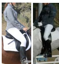
Classic dress : 8 points