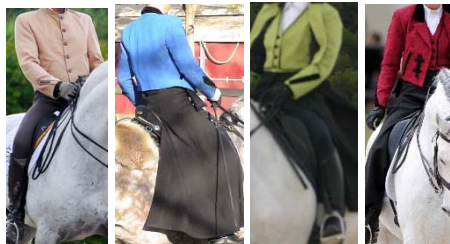
14 points with classical boots and trousers